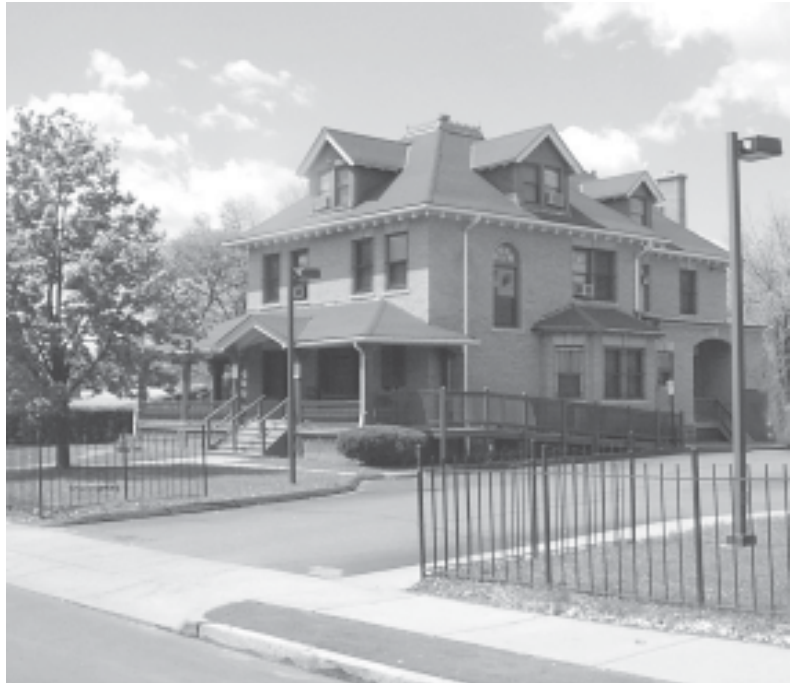
CAC Headquarters at the Mack Center on Vine Street

interests. By encouraging stronger ties among suburban and urban member churches and by establishing instruments and structures for lay involvement, the CAC seeks to create a practical vision of social witness, social development and social reform. The CAC is a faith-based organization that is strictly non-sectarian in its activities and programs.